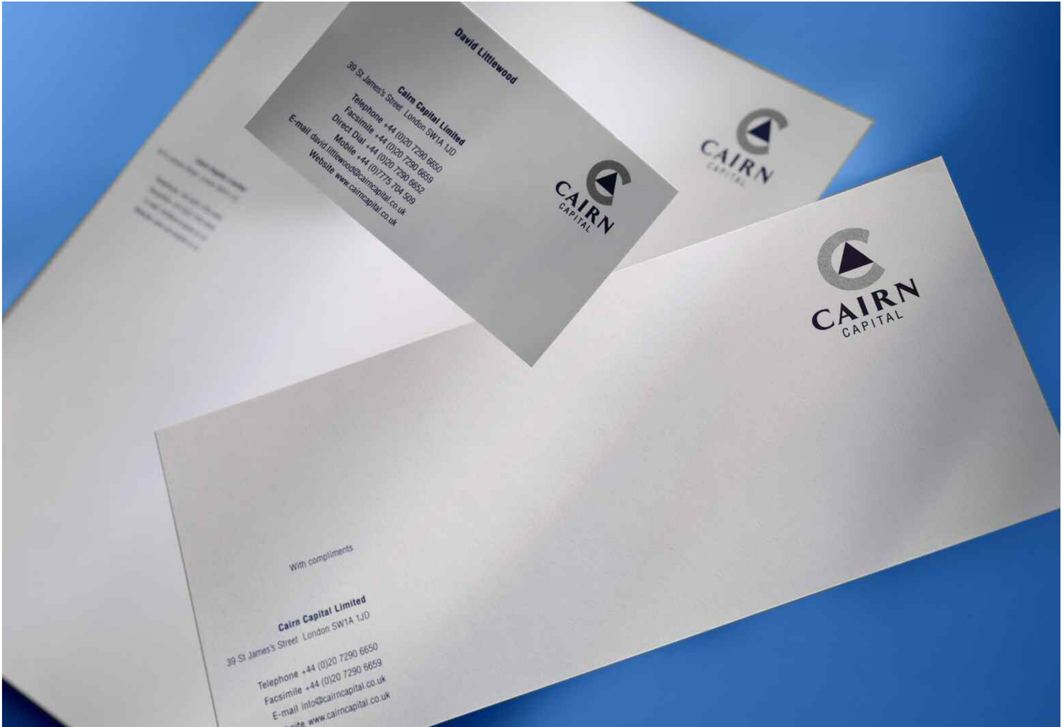
Corporate stationery range.