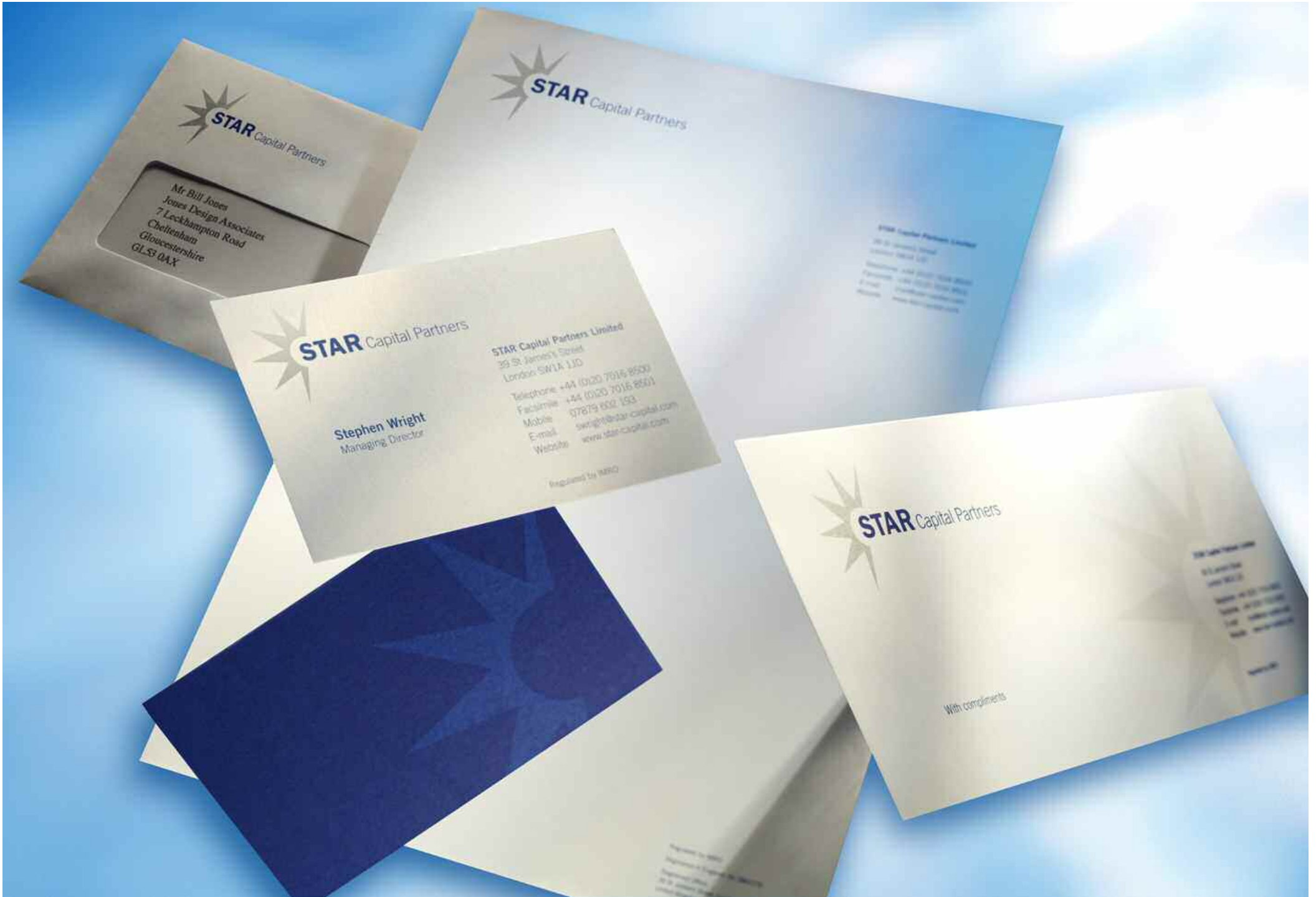
Corporate stationery range.