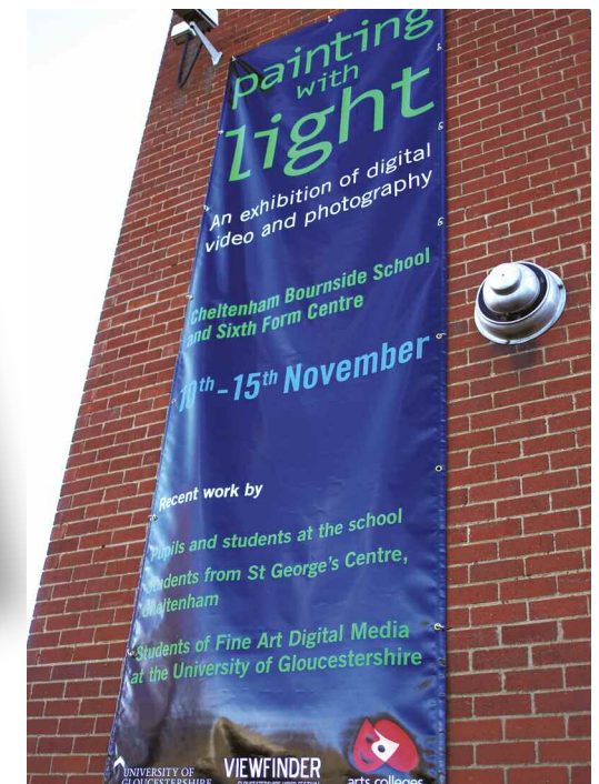
Exhibition graphics for 'Painting with Light' for Cheltenham Bournside School and Sixth Form Centre.