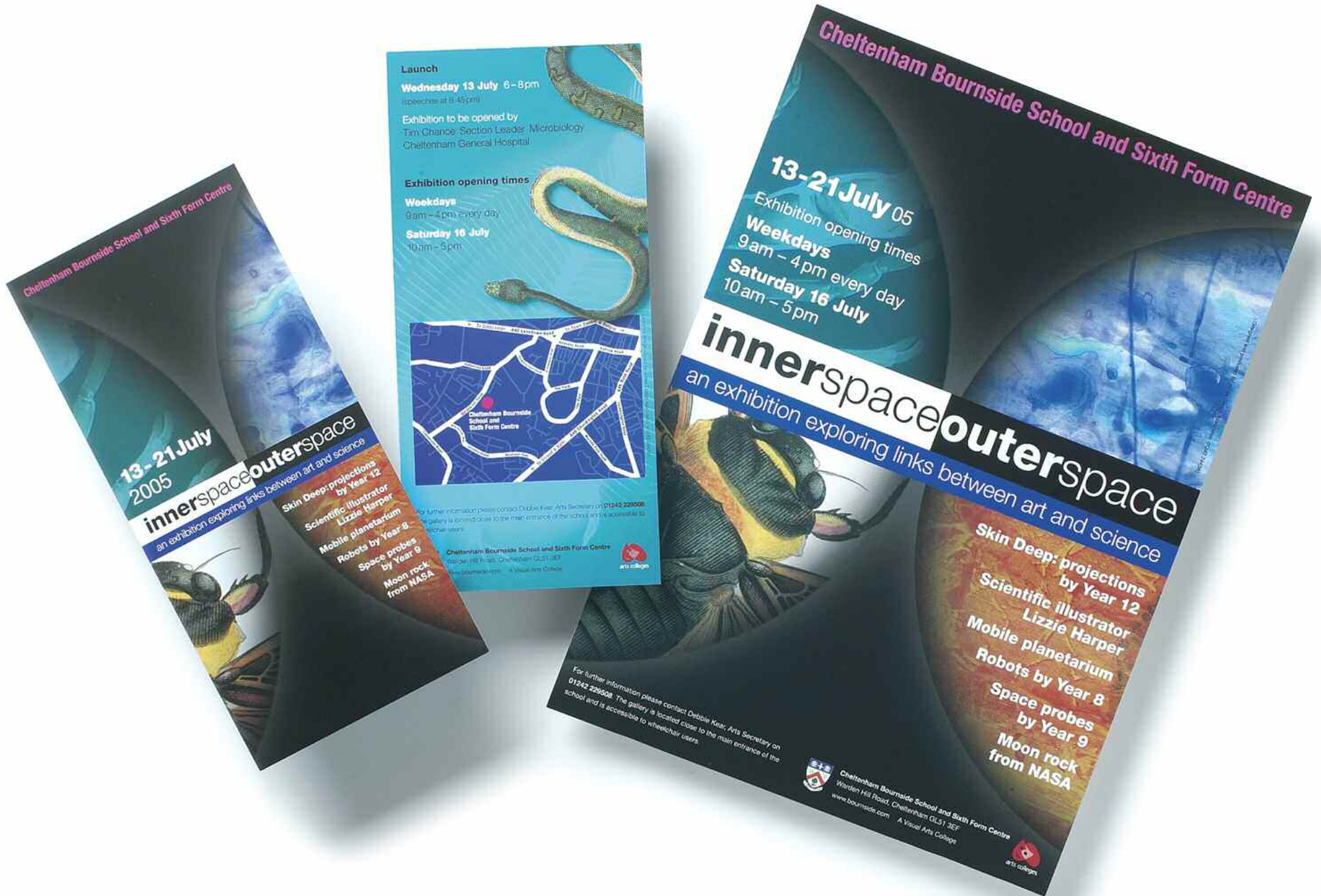
Exhibition graphics for 'Inner Space Outer Space' exhibition for Cheltenham Bournside School and Sixth Form Centre.