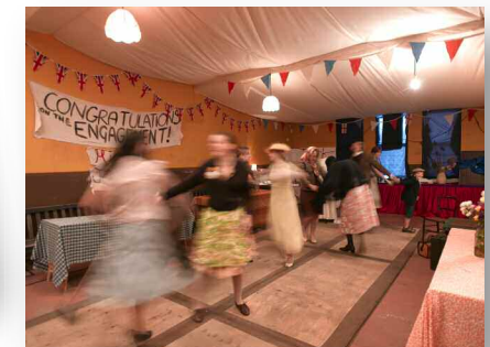
Exhibition graphics for 'War Stories' for Cheltenham Bournside School and Sixth Form Centre.